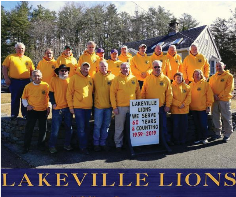
The Lions Club of Lakeville in Massachusetts celebrated their 60th anniversary at their new clubhouse. After 35 years of ownership they sold their facilities at Camp Joe Hooker, a historic Civil War site, and renovated an old nursery and local eyesore to make their "den."