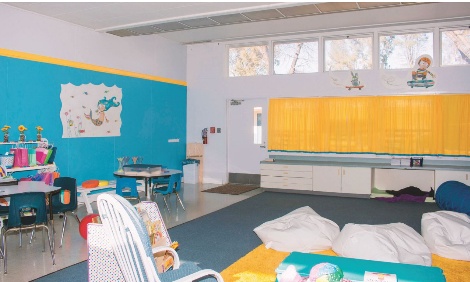
The PALZ room at Sycamore Elementary in Redding, Ca, is a welcome place for kids to refocus.