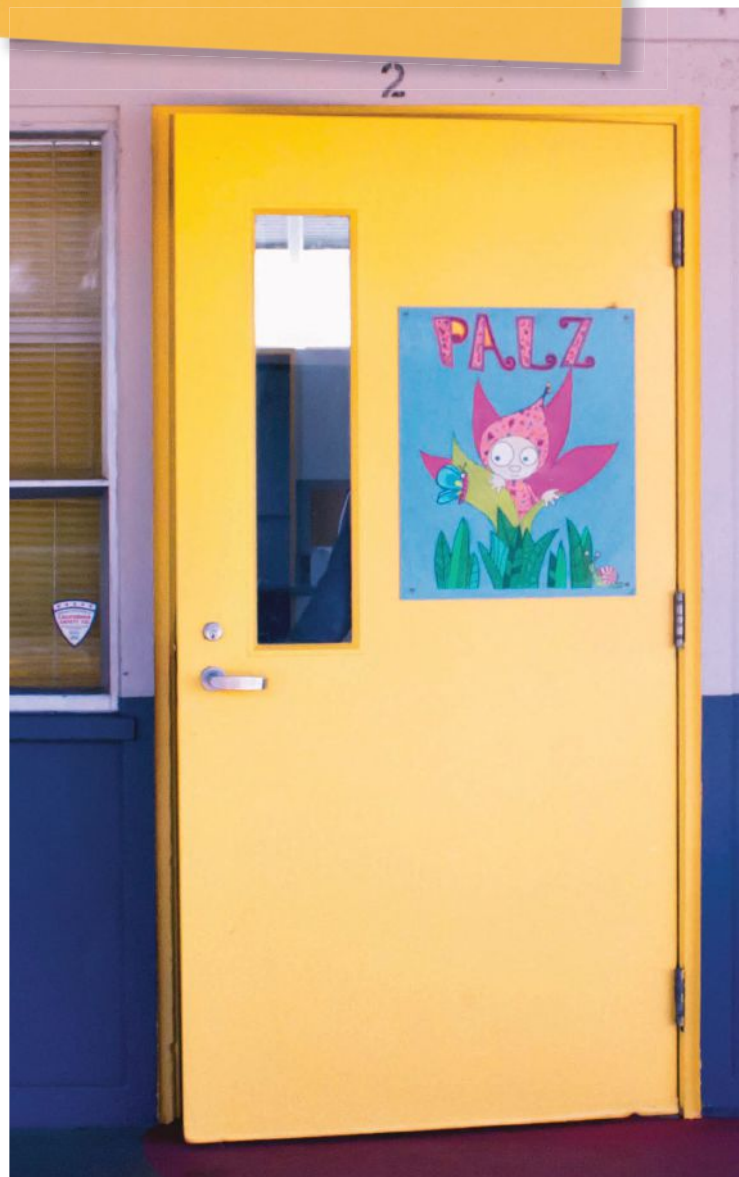
The yellow door welcomes kids who need a break from the classroom to center themselves and refocus so they can learn.

“We have these kids for six to seven hours a day—a good portion of their waking hours. It’s up to us to help our students.”