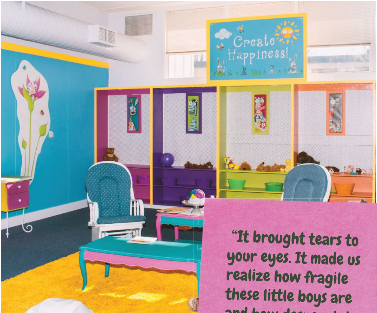
For students who are struggling, gliders are a nice place to relax and write in their journals.

and sharing strategies so they could figure out what helped him.