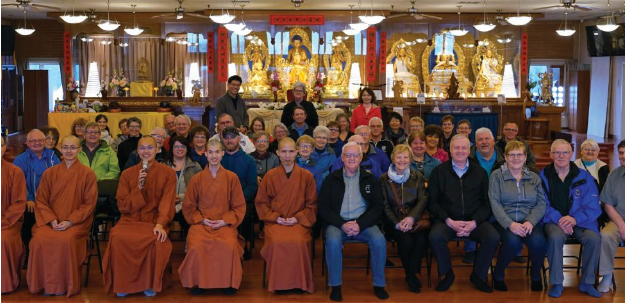
Members of the Summerside Lions, Kensington Lions, and St. Eleanors Lions and Lionesses , enjoyed a private visit and homemade cookies with the Buddhist monks in Little Sands on Prince Edward Island, Canada.