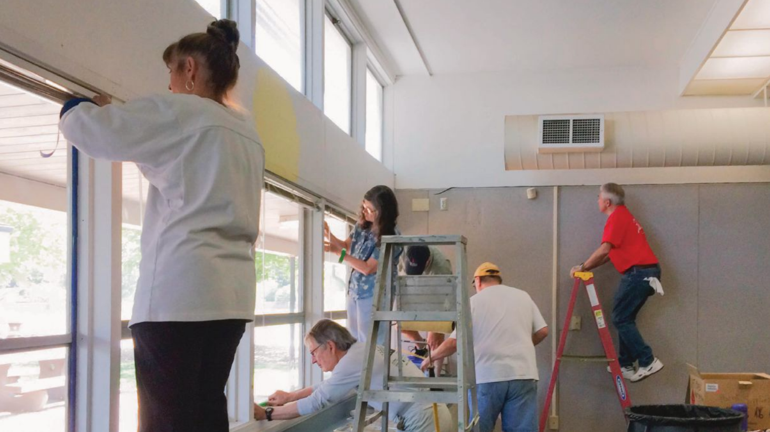
Redding Breakfast Lions prepare to turn a classroom into a sanctuary for troubled kids.