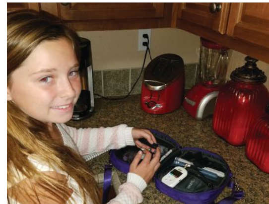
Lions are committed to improving the quality of life for people worldwide who are living with diabetes.