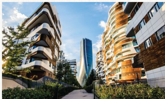
Skyscrapers in the CityLife district put Milan's vibrant modern architecture on display.