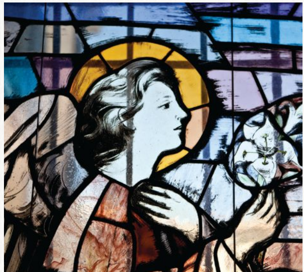
Stained glass is just one of the stars of the art scene in Milan.

July 5-9, 2019, Lions will be converging on the city famous for its works of art—and the artists who made them—to discuss a different kind of art form. Service, the act of giving, is itself a kind of art. And this summer, Lions will be using their creativity to work toward solutions to the world’s biggest problems. If it’s inspiration you’re looking for, you’ll find it in Milan.