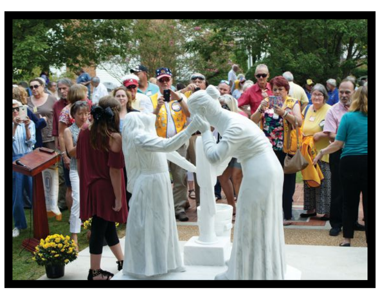
The new statue at Ivy Green is much admired.