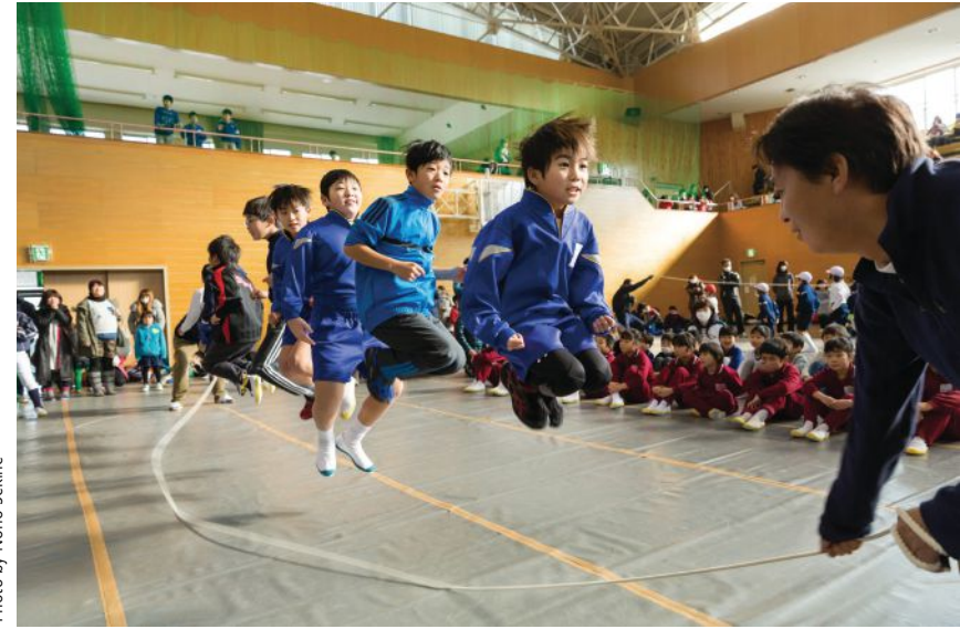
Japanese students compete in the Lions' event.

Takahashi Civic Gymnasium sits on an unassuming street in Takahashi City, but one day annually since 1990 the place is really hopping. Takahashi Lions sponsor a jump rope competition for grade school students. Last year more than 400 students competed in team and individual events. The competitions for the teams typically end relatively swiftly because of the difficulty of jumping together. But matches for individuals often last more than 20 minutes. That leaves the children out of breath and "many adults holding their breath waiting for the winner," according to the Japanese LION.