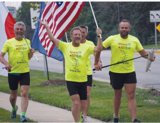
The Lions make their way to Chicago.

Temps approached the 90s as they kicked off. Then came tropical storm Cindy, chasing them with high winds and buckets of rain. Passing cars slapped the runners with walls of