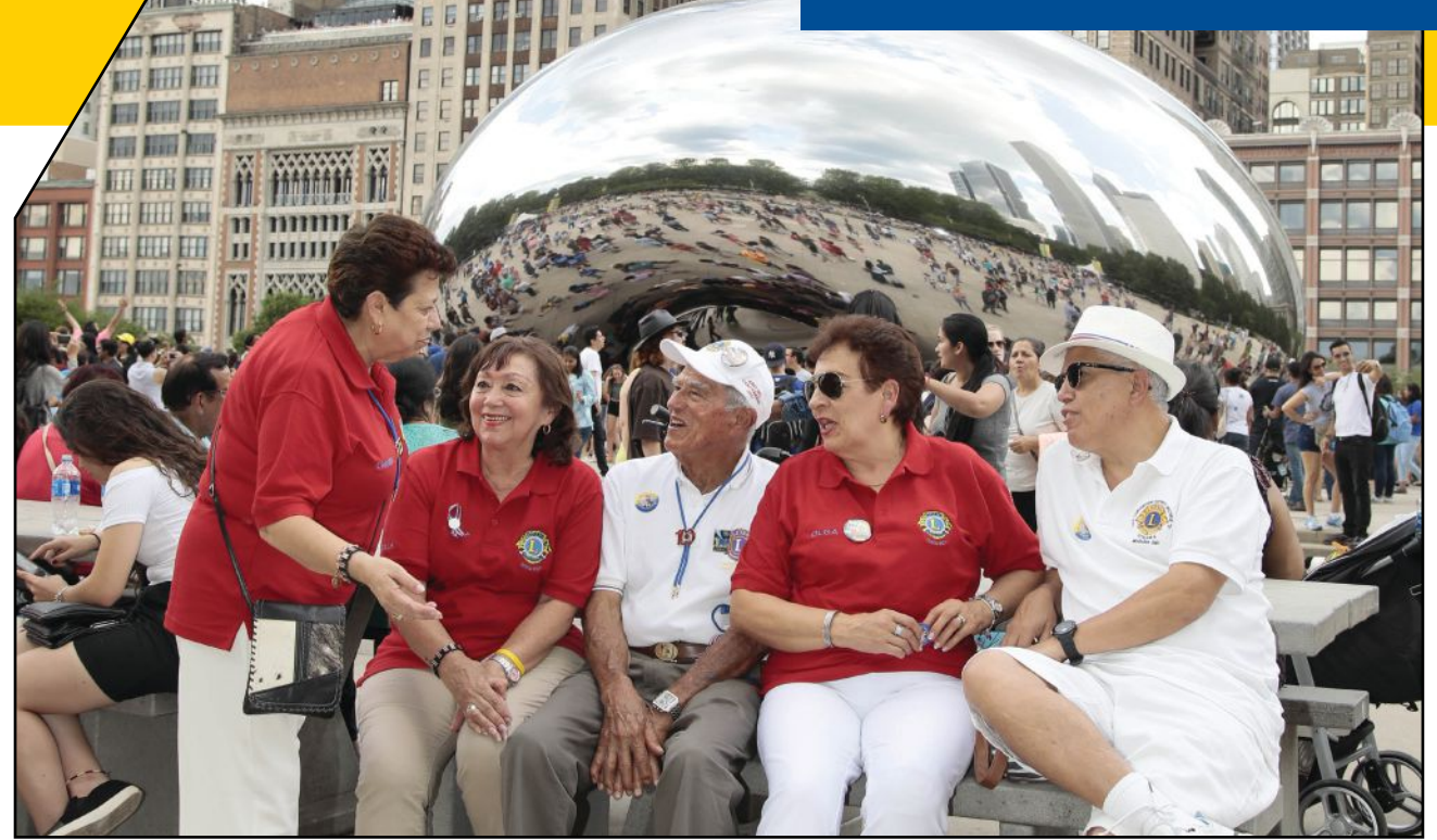
Lions attending the convention chat at "the Bean" at Millennium Park in Chicago.