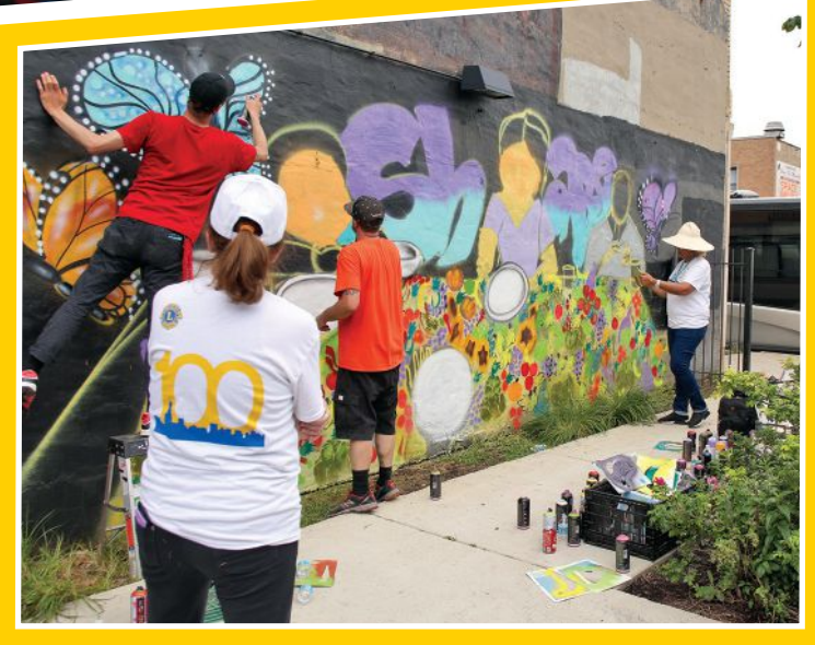
Lions and Leos paint a mural on healthy eating in a Chicago neighborhood.