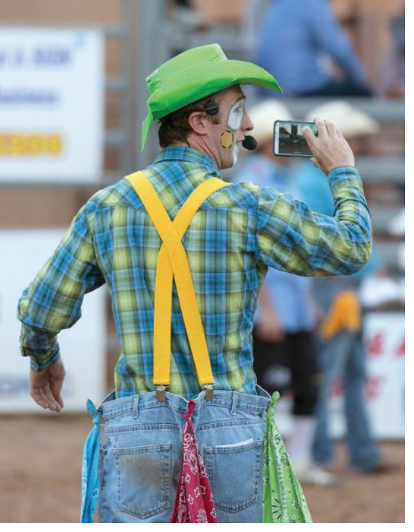
Even an old-fashioned rodeo is not immune to digital technology.