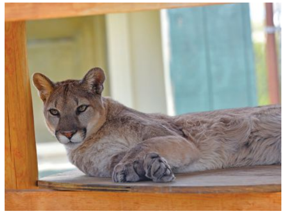
With Lions' support, the cougars have more space and a place to relax in New Mexico's Wildlife West Nature Park.

Wildlife West Nature Park works with volunteers providing educational programs, chuck wagon dinners and entertainment.