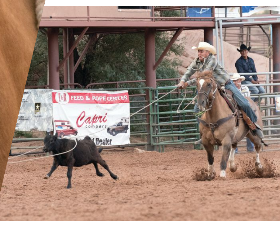
Give a cowboy on a horse a rope and a calf, and the result is inevitable. (Opposite) That's right: grip the horns in the middle, not on the ends.