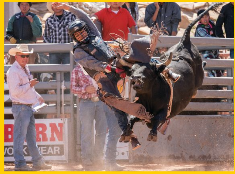
Sometime riding a steer means riding air.