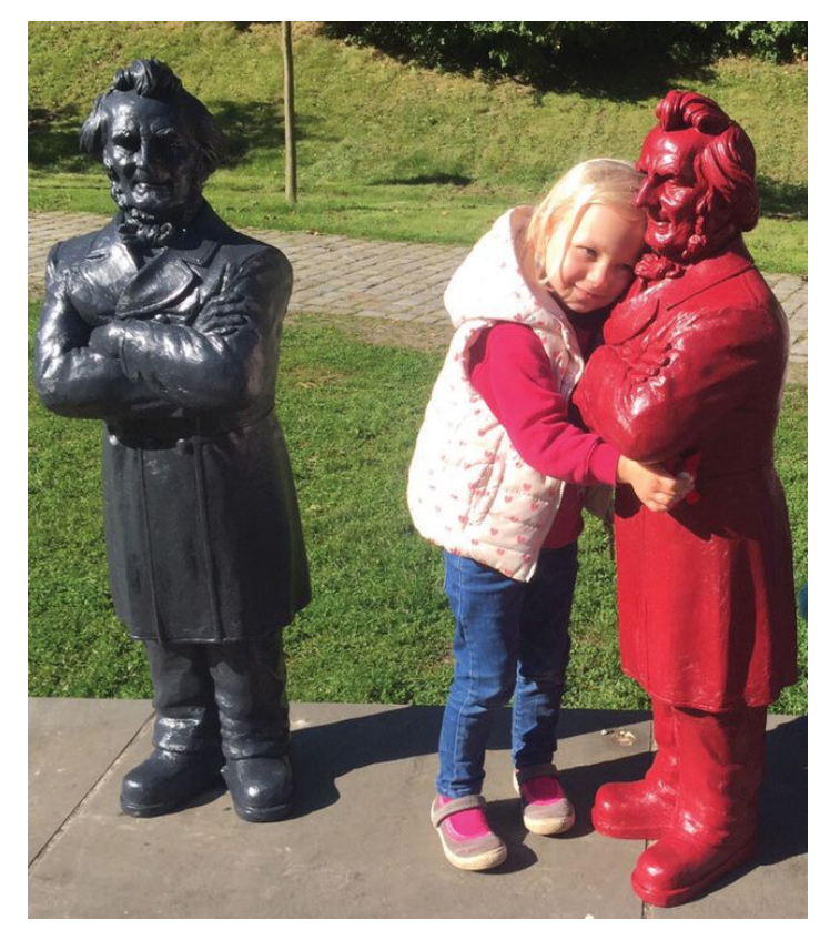
The statues of an admired historical figure in Germany were embraced.

Grateful for Lions' repair of the obelisk, the town council made a donation to the club. In turn, the club fixed the roof of St. Tudno.