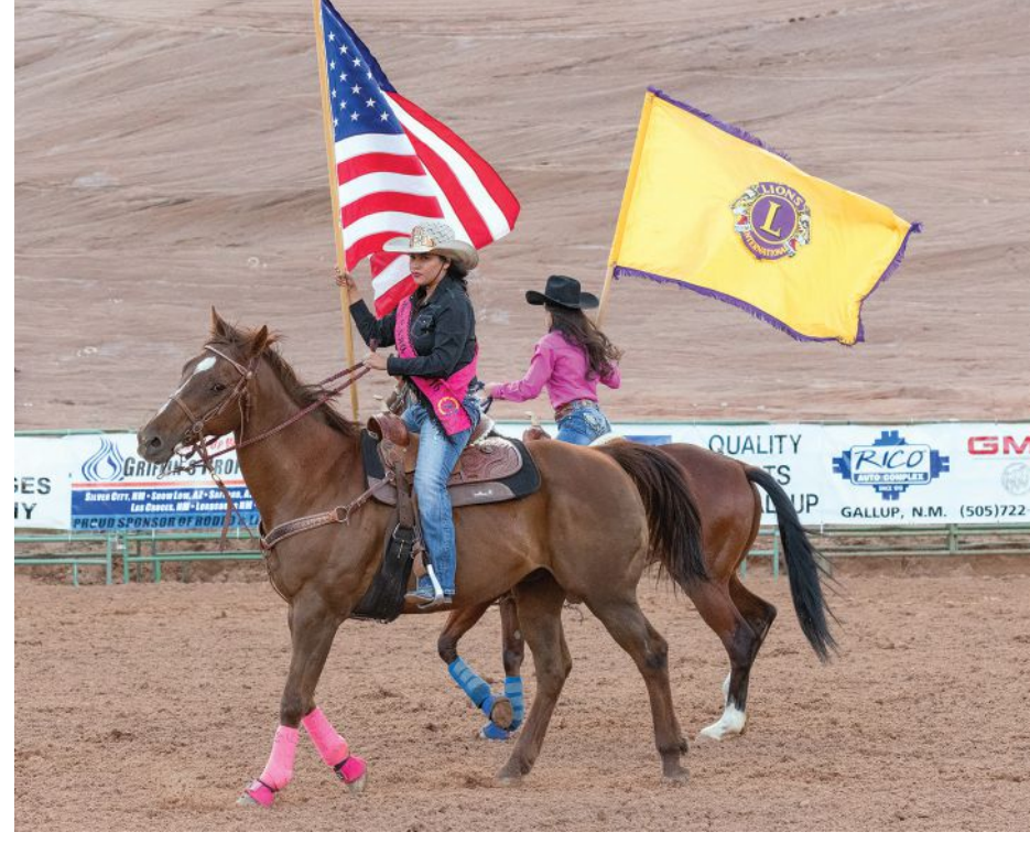
There was no doubt this was a Lions' rodeo.